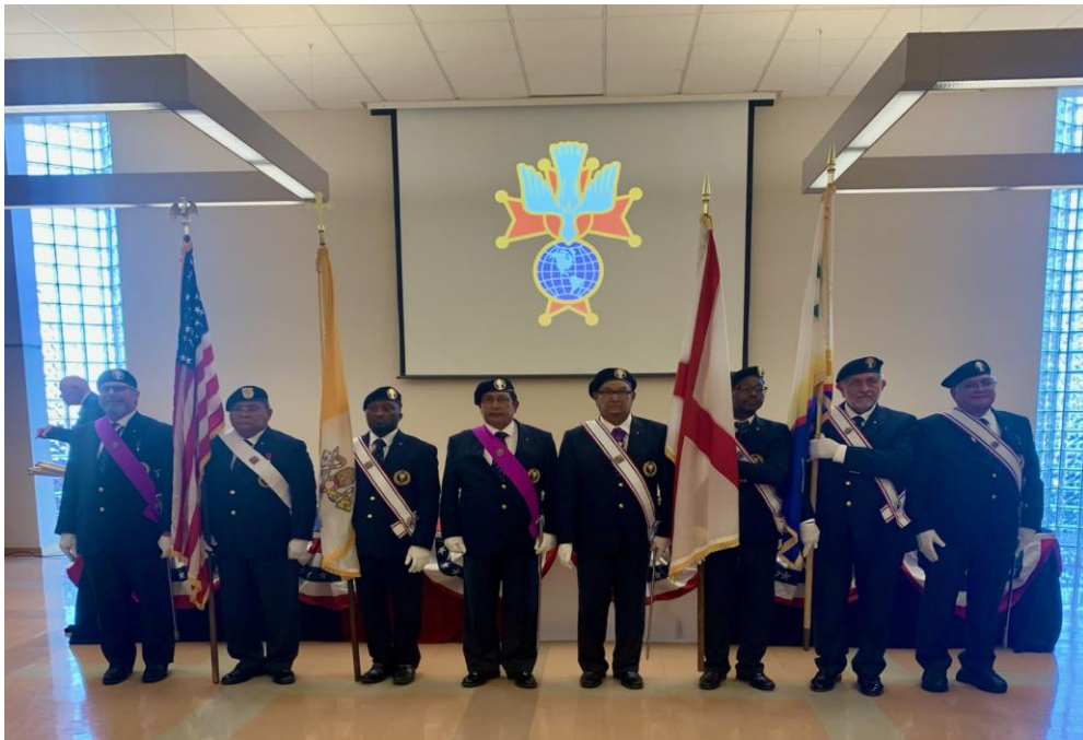
Color Corps for the 4 th Degree Exemplification, at Holy Spirit.