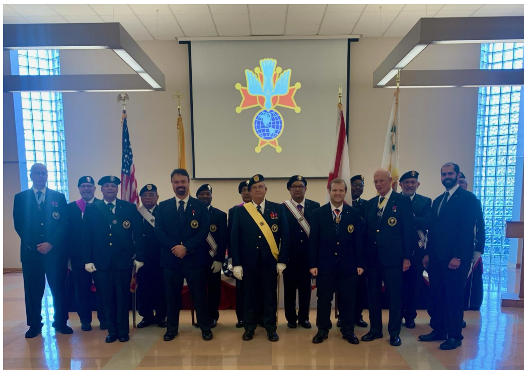
Exemplification Team and Color Corps for the 4 th Degree Exemplification, at Holy Spirit.