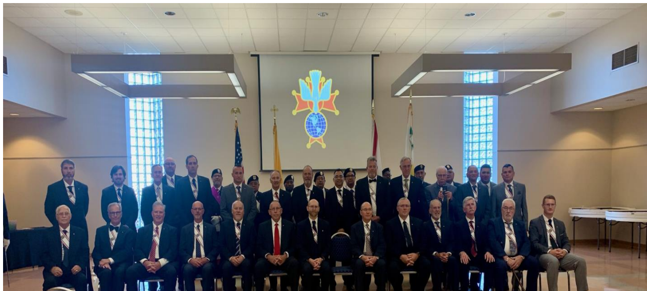
Exemplification Class, Team and Color Corps for the 4 th Degree Exemplification, at Holy Spirit.