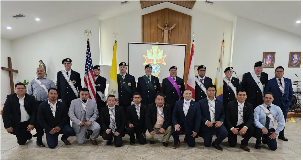
Color Guard with 12 new Sir Knights.