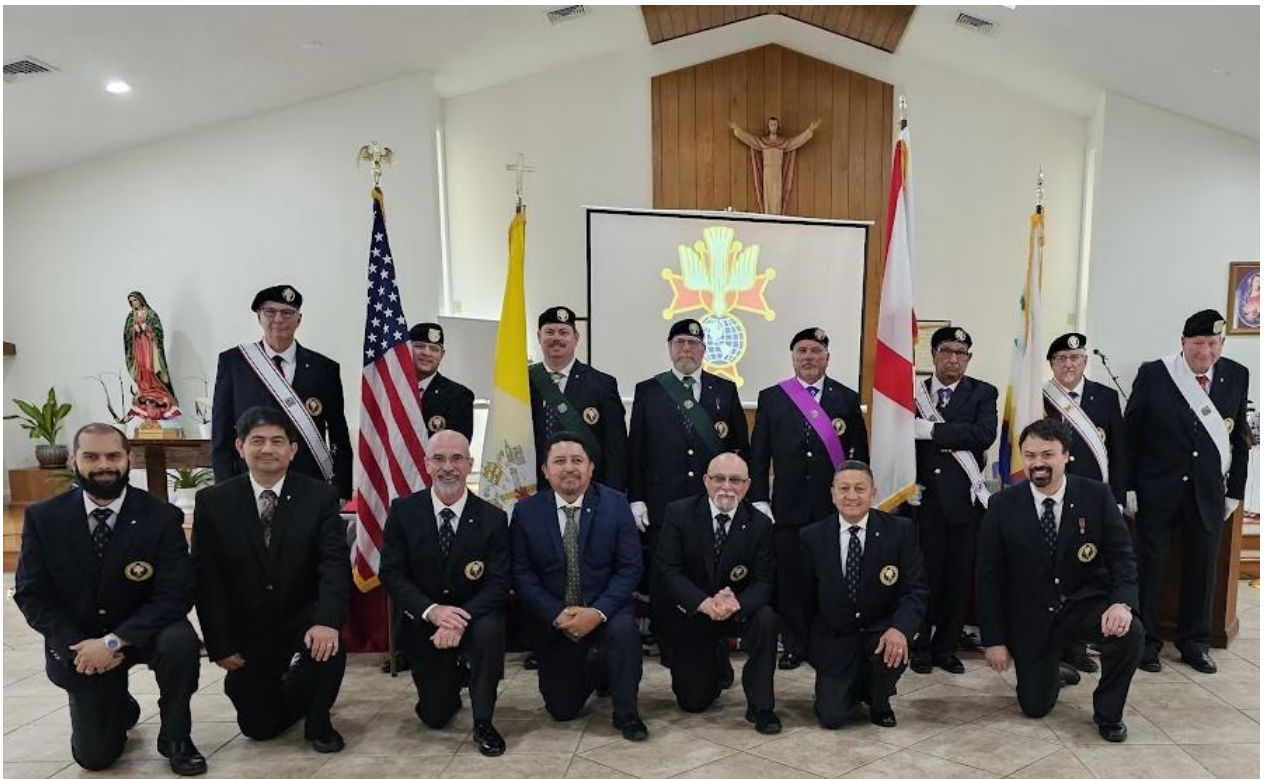
Color Guard with North Alabama Spanish Exemplification team.