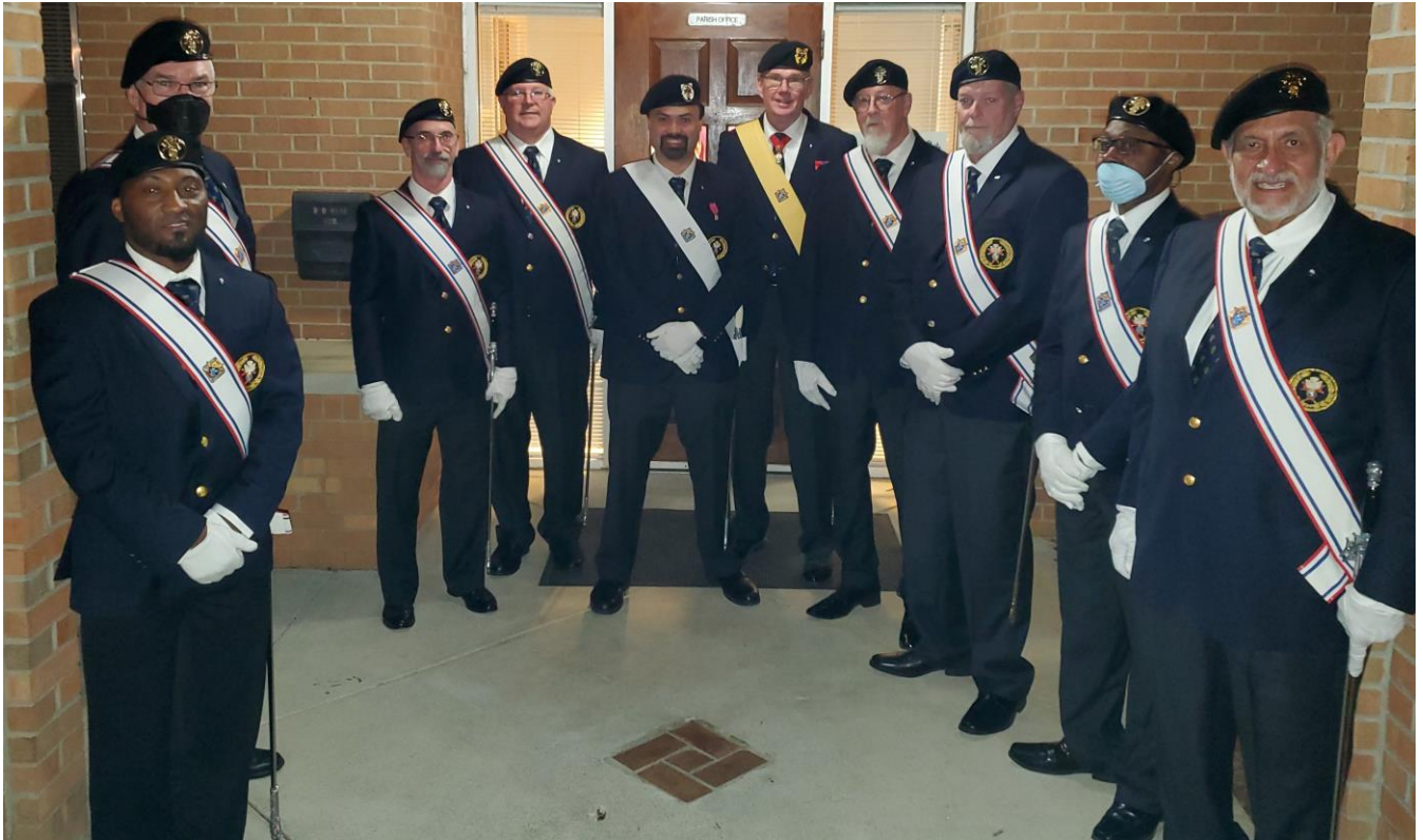
March 30, 2024. Assembly 0004 Honor Guard prior to the Easter Vigil Mass at Holy Spirit Church.