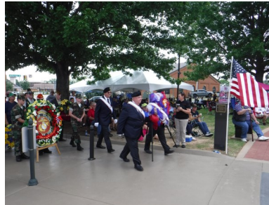
Sir Knights from Assembly 0004, participating in the Memorial Day Wreath Laying at the Veteran's Memorial in Huntsville on May 27, 2019