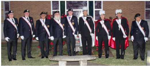
Sir Knights from Assembly 0004 (Honor Guard), after participating in the Easter Vigil Mass at Holy Spirit on April 21, 2019