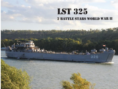
LST 325 2 BATTLE STARS WORLD WAR II

INGALLS HARBOR 802-A WILSON ST, NW. DECATUR AUG. 29-SEPT 3, 2019 Tours Daily 10:00am-5:30pm