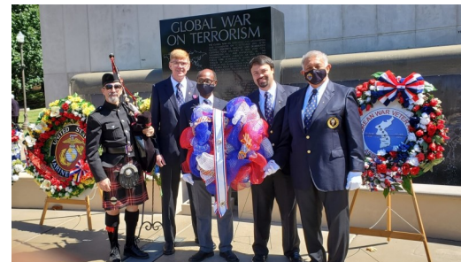
Sir Knights after laying our wreath at the Memorial Day ceremony at Veteran's Memorial Park in Huntsville.