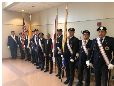
Sir Knights from Assemblies 0004, 2420, and 3499 serving in the Color Guard at our June 19th Exemplification