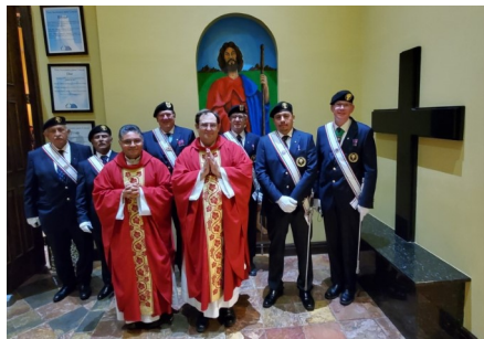
Sir Knights serving in an Honor Guard at the Chapel of the Holy Cross in Albertville for Confirmation.