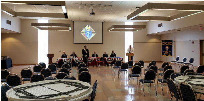
Our Spanish Language Exemplification Team, at Holy Spirit on November 13th, 2022. This was a rousing success, with another such planned Exemplification later in 2023.