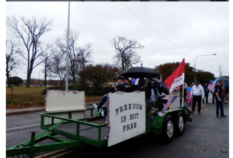
Sir Knights of Assembly 0004 and 2420 participating in a rain-soaked Veteran's Day Parade through Downtown Huntsville on November 11th, 2022.