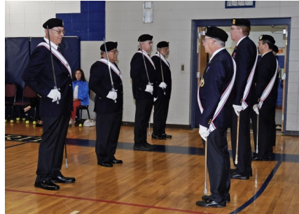
Sir Knights of Assembly 0004 and 2420 Honor Guard at the Holy Spirit Regional School "Salute to Our Veterans" program, held on November 9, 2022. This was our first such program held in-person since 2019, so this was very much enjoyed by all!