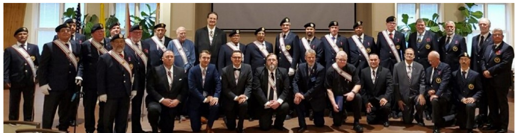
November 13, 2021 Exemplification in Guntersville, with 7 members of Assembly 0004 participating as well welcoming one new Sir Knight into our Assembly!