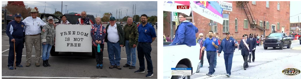
Sir Knights from Assembly 2420 and 0004 at the Huntsville Veteran's Day Parade, including a screenshot of the broadcast, which can still be viewed ( click here ).