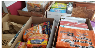
Care packages mentioned in the article on the right, packed up and ready to go! 18 Priority Mail boxes were shipped on December 1st (16 to Okinawa, and 2 to Europe)