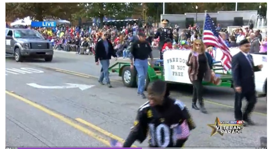
Snapshots of WAFF-48's coverage showing Assembly 0004 marching in the Veteran's Day Parade