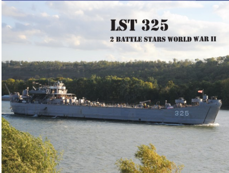
LST 325 2 BATTLE STARS WORLD WAR II

INGALLS HARBOR 802-A WILSON ST, NW. DECATUR AUG. 29-SEPT 3, 2019 Tours Daily 10:00am-5:30pm