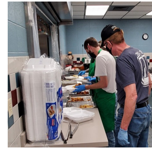
Sir Knights of Assembly 0004 (from both Councils 764 and 11672) worked together to provide Lenten Fish Fry dinners for both Parishes (Holy Spirit and Good Shepherd, respectively)